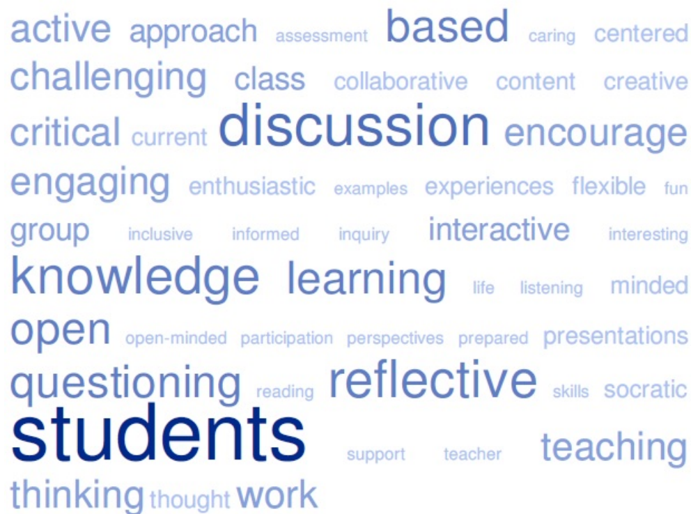
Figure 1. Word frequency display of the codes for teaching philosophy.

“recognizing alternative views” and “devil’s advocate” and “often the obvious is wrong” were coded as both ‘open’ and ‘questioning’. The most frequent descriptors of teaching philosophy were: discussion based, student-focused, reflective, connections/ grounded in real life situations, exploration, collaborative, challenging, questioning/ question assumptions, critical/analysis, open-minded, adaptive, student-led, current, open (exercising all points of view but with valid arguments), flexible.